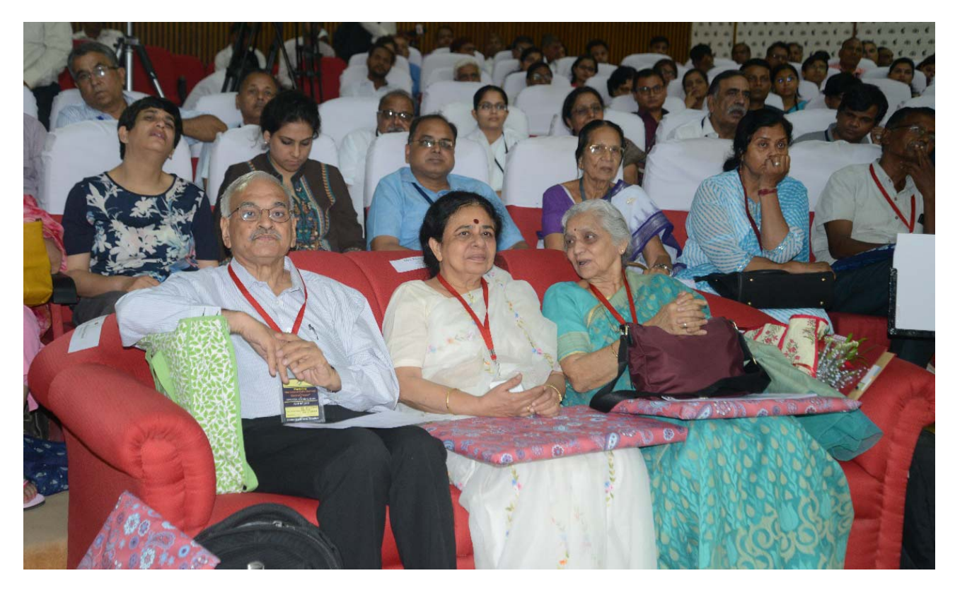
Keynote Speakers at the Workshop