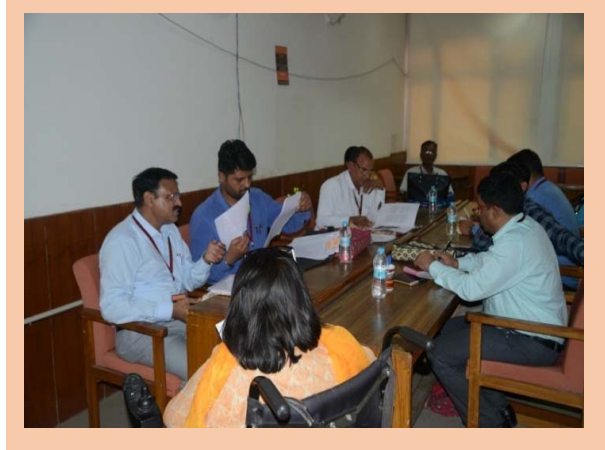
WG - Visually Impaired